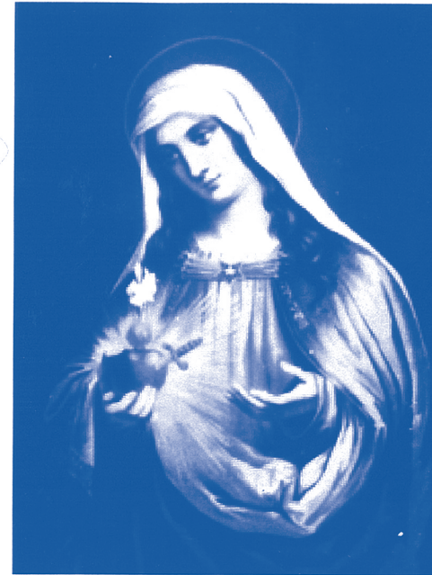
Mary, Cause of our Joy

www.mcpriests.com www.corpuschristimovement.org